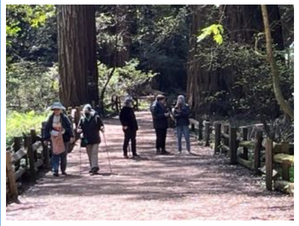
Village monthly walks; open to all Village members. See Coming Up section for details on our May walk.